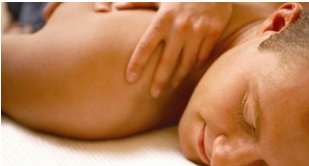
A good massage can sometimes leave you feeling like you had a good workout.

massage may have been too intense, and the therapist should adjust for this in the next session. However, just as with exercise, when your body adjusts to having this type of workout, your physical response will also be less intense.